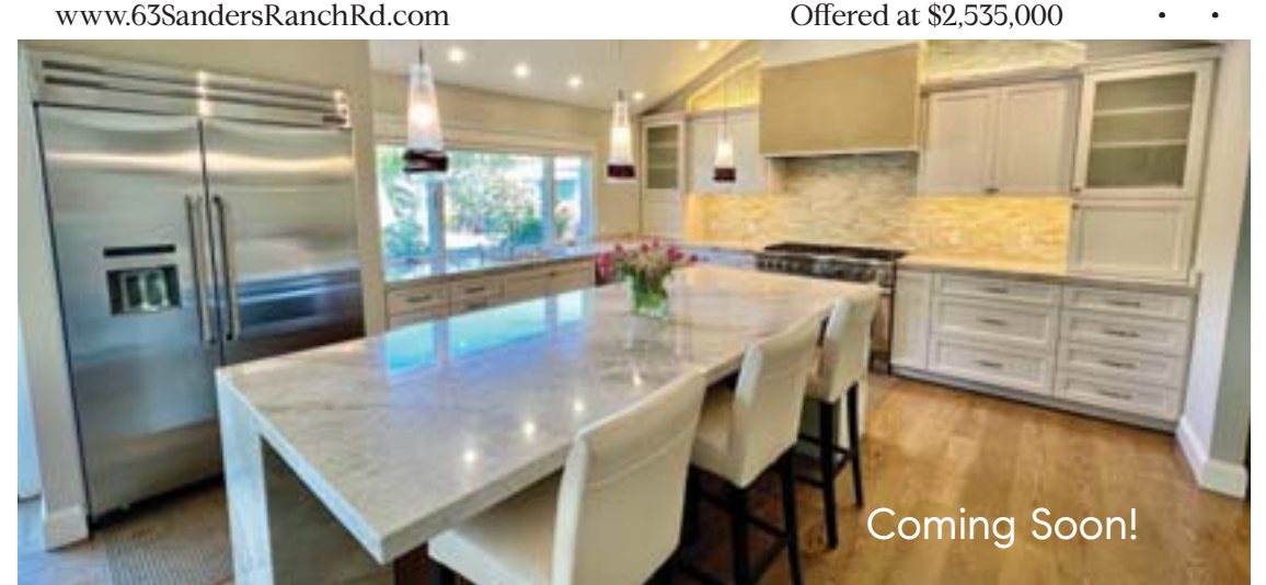
47 Sanders Ranch Road, Moraga 3463 SqFt / 4 Br / 3.5 Ba

63 Sanders Ranch Road, Moraga 3114 SqFt / 4 Br / 3 Ba Wonderful single level home with remodeled kitchen & baths. Serene backyard.